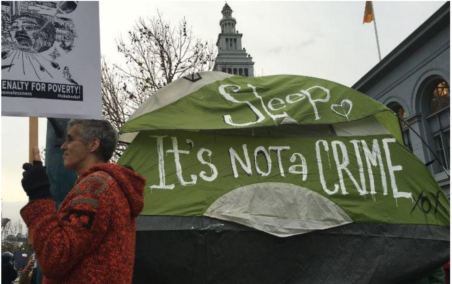
Demonstrators gather near Super Bowl City to protest San Francisco's response to homelessness on Feb. 3, 2016.

$54 million from $35 million in the 2016-2017 fiscal year, the San Francisco Chronicle reported in 2018. 2019 is expected to hit nearly $60 million.